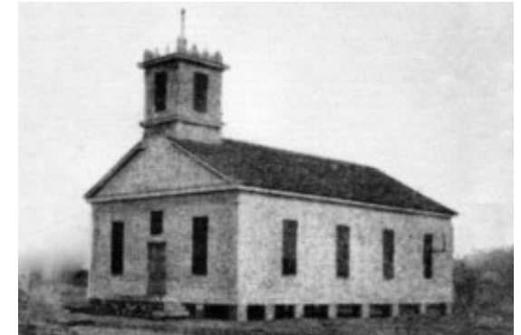
Building year 1828